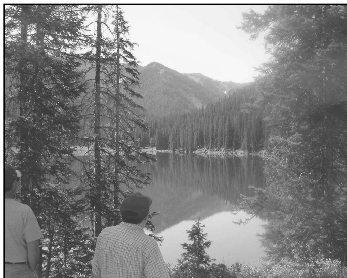
The July 15th WWA Summer Water Resources Educational Tour included a stop at Cottonwood Lake. The WWDC has funded a study of rehabilitating this dam and enlarging the reservoir.