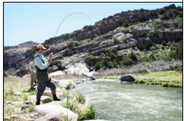
Fly fishing on the Platte River below Pathfinder

Ramada Plaza Riverside Inn Reservations requested by June 30th Phone: (307) 235-2531 Please request WWA Rooms