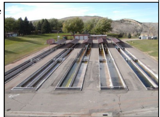
Dan Speas Fish Rearing Station