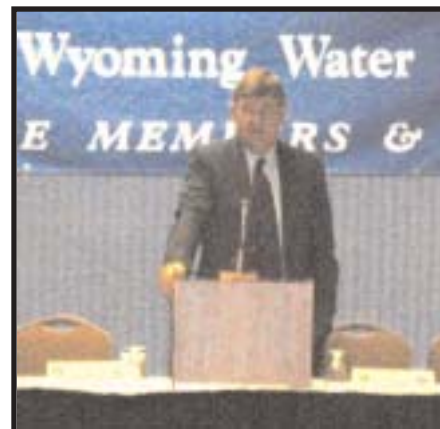
Governor Freudenthal expressed his intent to bring more focus and funding resources for water storage development to the Wyoming Water Development Program during the upcoming 2005 Legislative Session.

The majority of the presentations made during the Education Seminar and Annual Meeting can be viewed and downloaded on WWA's website: www.wyomingwater.org by clicking in the blue box on the homepage. Take a look at these excellent speeches and Powerpoint presentations!